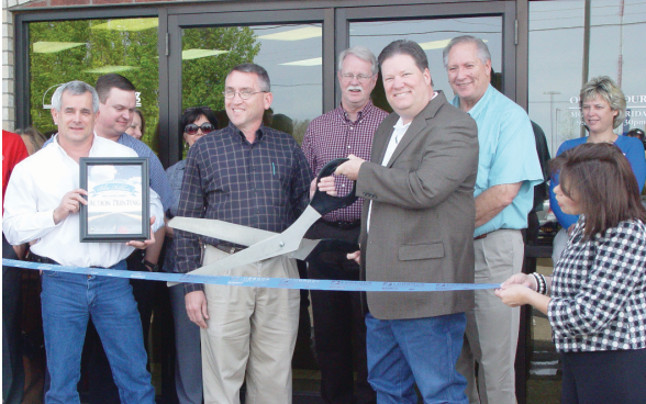
Action Printing Employees Receiving the Blue Ribbon Award

Action Printing was chosen as a recipient of the U.S. Chamber of Commerce's Blue Ribbon Small Business Award for the year 2009. We were one of the only fifty businesses selected from entrants across the entire United States.